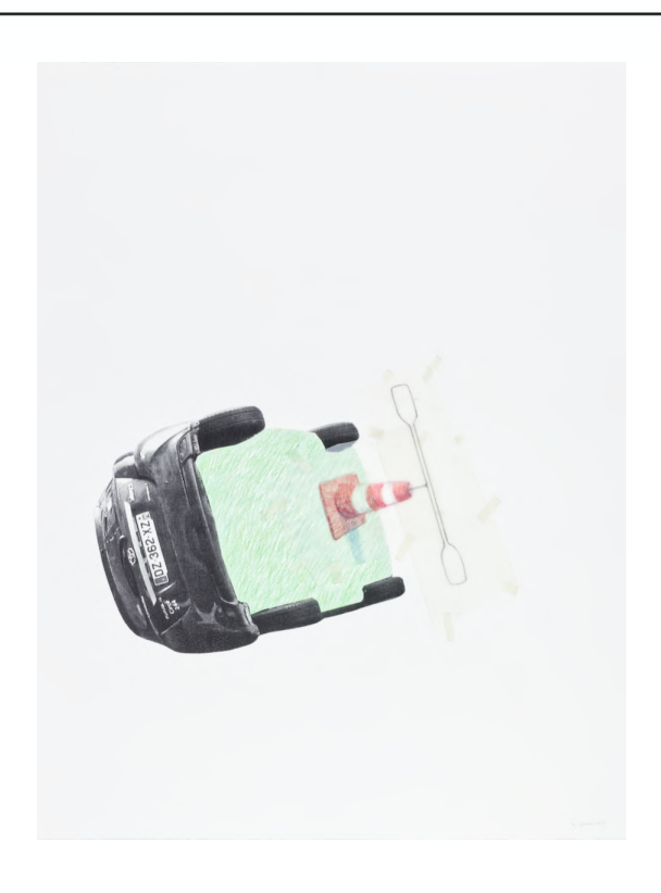
Après l'ordinaire #1,2021, Coloured pencil on photocopy, Graphite and coloured pencils on tracing paper, adhesive, 50 x 38,5 cm