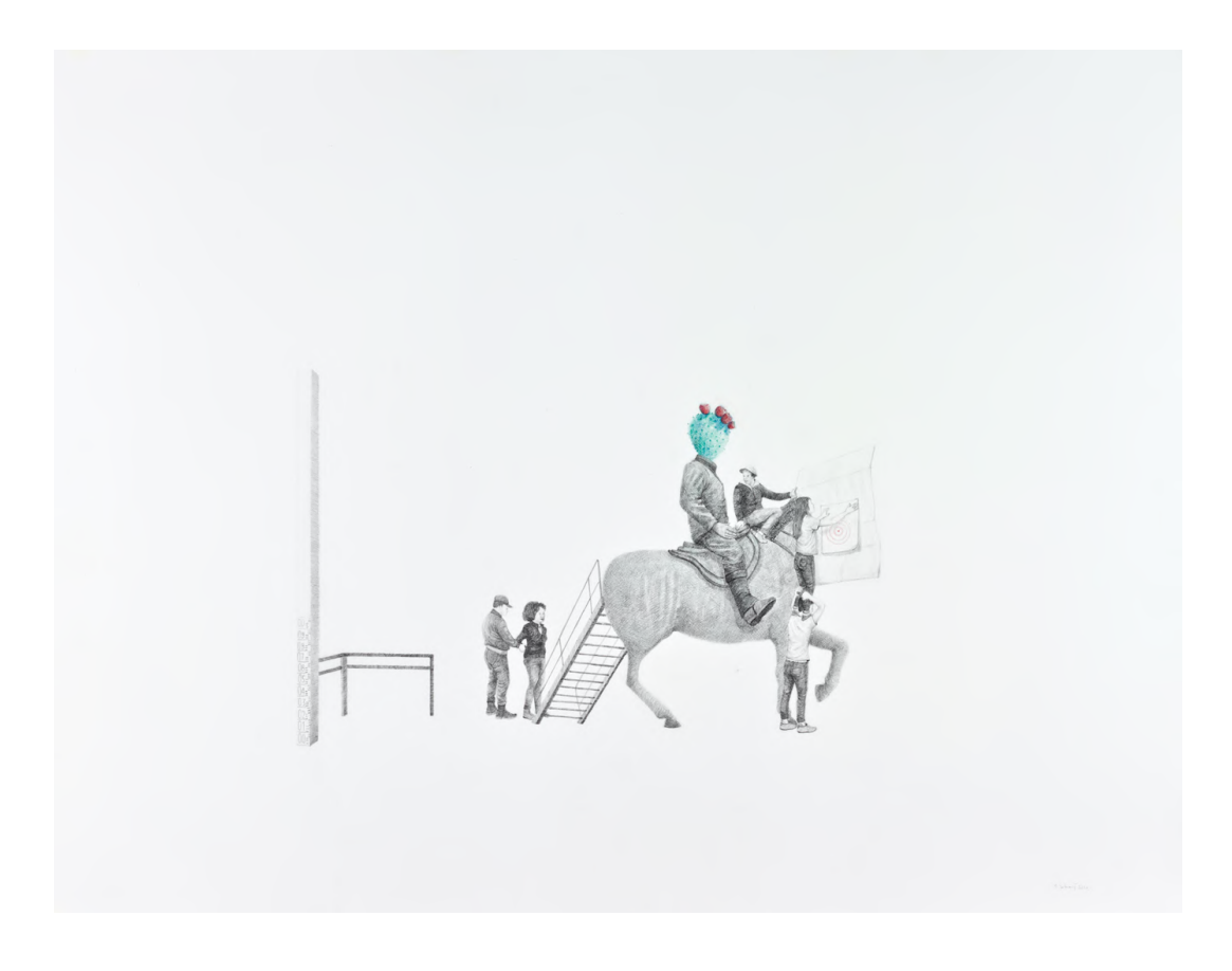
Prélude de l'élan visible #2, 2020, Graphite and coloured pencil on paper, 50 x 65 cm

In homage to the poet Jean Sénac, the title of the exhibition "Rien sinon du rêve au doigt" is borrowed from one of his poems entitled "Trouvure".