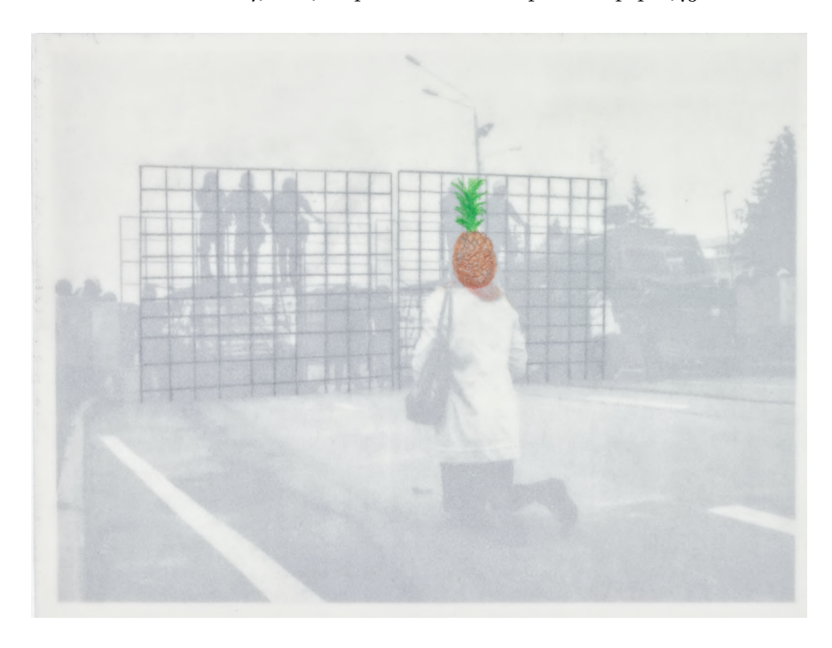
\textit{Untitled \#7,} \textbf{2021} (Altérables), Photocopy, graphite and colour pencils on tracing paper,} \textbf{15,} 5 \times \textbf{19,} 8 \text{ cm}