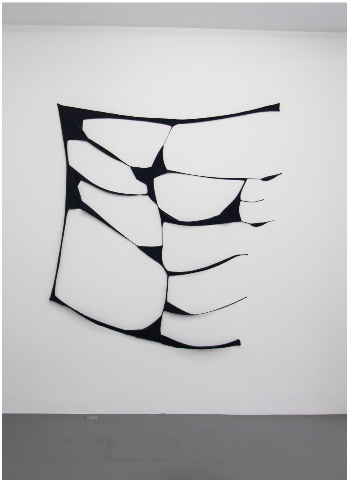
Marion Baruch, Mon corps où es-tu ? , 2016, jersey, 199 x 186,5 cm, courtesy : artist & Galerie Anne-Sarah Bénichou