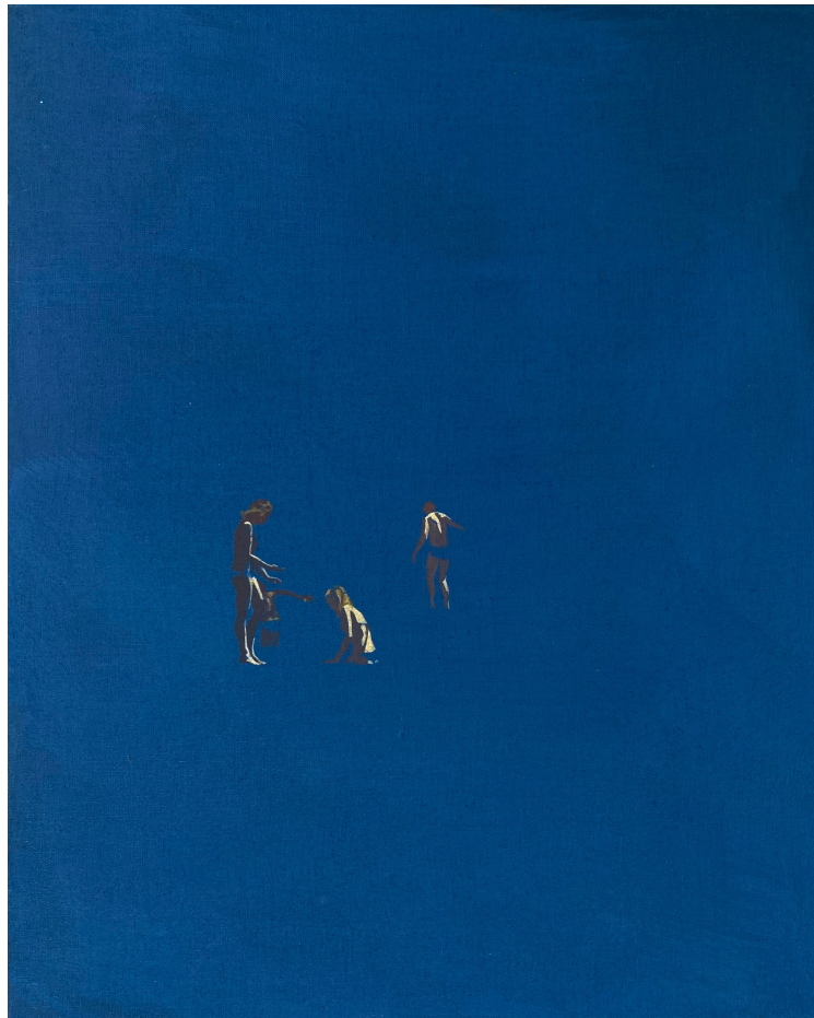
Four Summers (Margaret Island) , 2024, oil on linen, 50 x 40 cm, courtesy of the artist and Galerie Anne-Sarah Bénichou

Repetition, temporality, and variation are constants in Alexander Massouras's work. Departures experiments with these ideas through a sequence of paintings drawing on found images of leisure—from postcards, advertisements, travel brochures, and other archival objects. In revealing a landscape of seasons that never change, Departures plays on the conventions of 'Four Seasons' painting sequences, which allows for a critique of these archival images motivating concept: leisure, itself a fiction of separated and measured time.