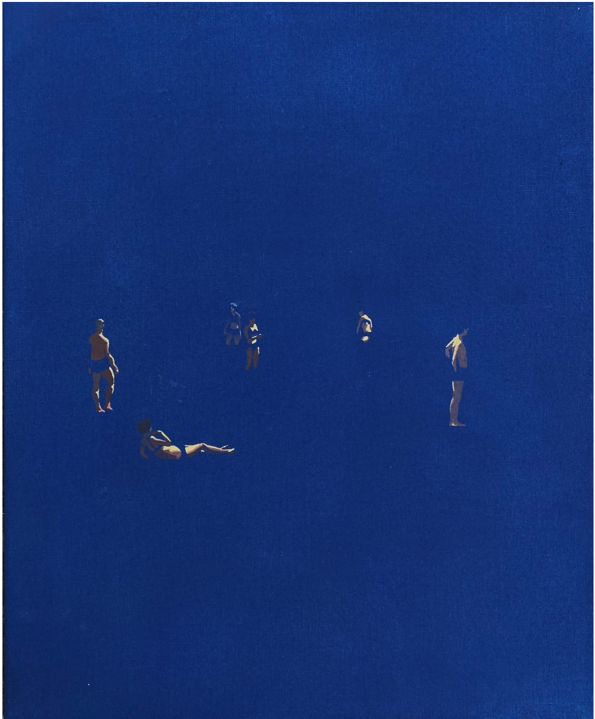
Four Summers (Gulf Shores) , 2024, oil on linen, 56 x 46 cm, courtesy of the artist and Galerie Anne-Sarah Bénichou